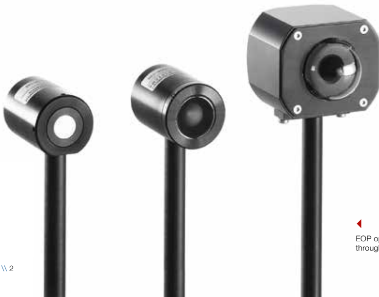
◀ EOP optical probes with different light throughput and angular response characteristic.

Like all spectrometers from Instrument Systems, the CAS 120 can be combined with any of a large number of adapters and other accessories using fiber-optic cables to permit a wide range of different tasks for one spectrometer. This enables the CAS 120 to be deployed efficiently in production, quality assurance, as well as in research and development. The integrated density filter wheel and the dark-current shutter also facilitate fully automated measurements over an extremely broad signal range.