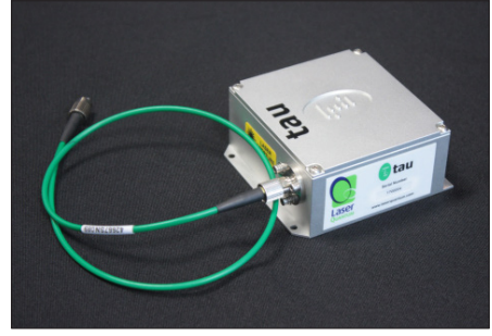
Fibre coupled tau.