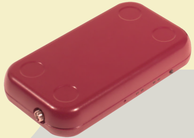
PErL Er-doped fiber laser system