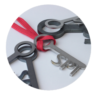
Thick Metal Cutting Mild Steel, Stainless Steel, Aluminium