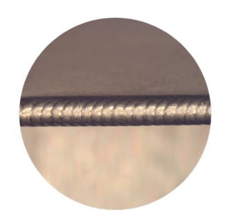
Welding Stainless Steel