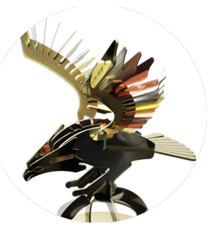
Cutting Copper, Brass, Aluminium