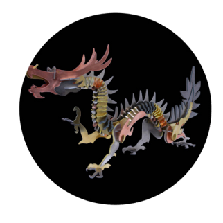
Cutting Brass, Aluminium, Copper, Mild Steel & Stainless Steel