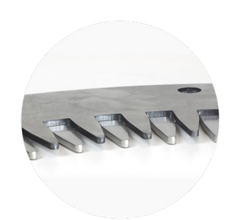
Cutting Mild Steel