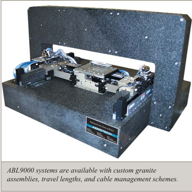
ABL9000 systems are available with custom granite assemblies, travel lengths, and cable management schemes.