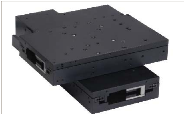
ALS130H shown in XY configuration.