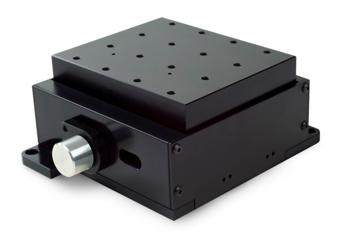
Manually Operated Version

Vacuum compatible and manually driven versions of the VS Series are available.