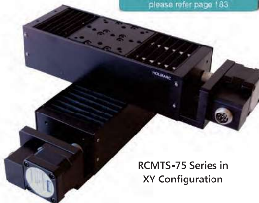
RCMITS-75 Series in XY Configuration

Controller sold separately please refer page 183